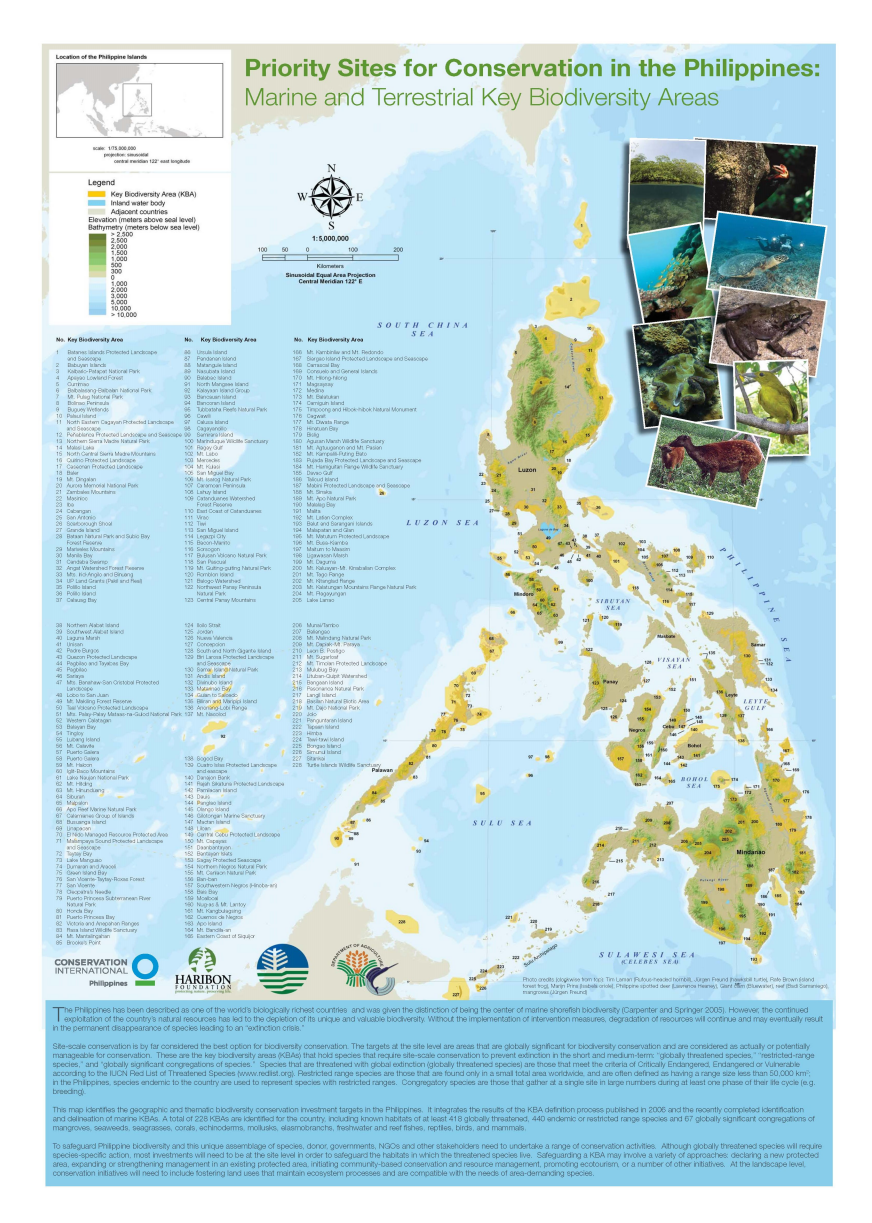
An integrated map showing the terrestrial and marine Key Biodiversity Areas of the Philippines. (Click the image to view the map in full resolution, or <u>click here</u> to download the map in PDF format.)

In brief, a total of 228 KBAs were identified in the Philippines, integrating a selection of 128 terrestrial and and 123 marine KBAs delineated in 2006 and 2009, respectively. These KBAs cover over 106,000 square kilometers and are home to 855 species, including 396 globally threatened, 398 restricted-range, and 61 congregatory species (see box story on KBA selection criteria). It's important to note that while KBAs are recognized as priority conservation areas, not all of them are covered by proper legislative measures at the time of writing. In fact, majority of them remain unprotected or at least only partially protected.