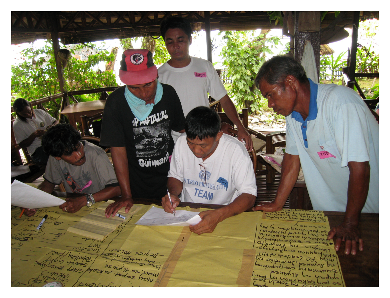
Leaders of IP communities can facilitate mediation and decision-making regarding policies and laws that involve their ancestral lands. (FPE)

In the political sense, IPs and ICCs also play a crucial role in mediating between policies and legislation made on the national-level and the actual impact that these statutes create on the ground. They are therefore ideal avatars of participatory government, as well as dependable conflict managers between the interests of the people and of the greater nation as a whole.